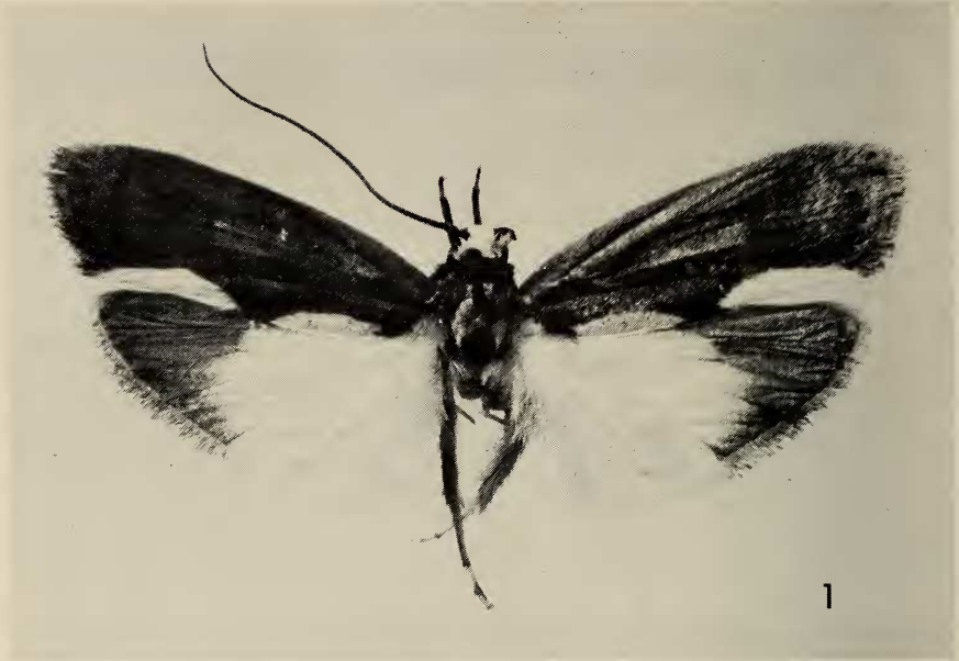
Fig. 1. Profilinota phillita , new species: adult male paratype.